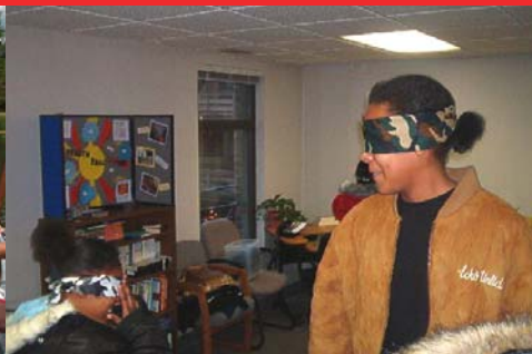
Health Realization Activity January, 2006