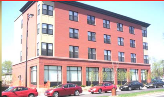
Lindquist Apartments May, 2006