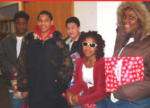
Gift Link December, 2006