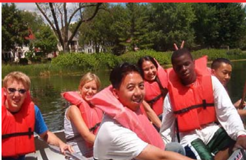
Youth for Justice August, 2006