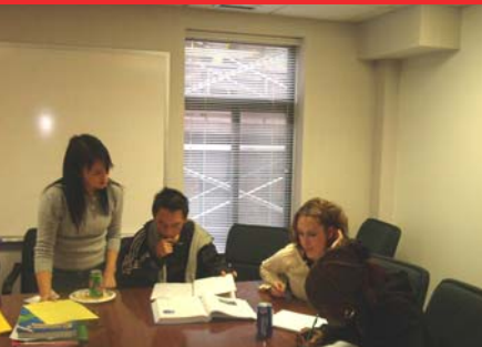
Tutor Link November, 2006