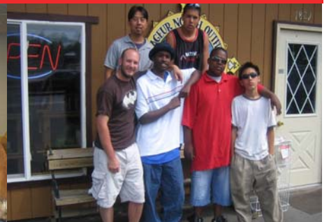
Boundary Waters Trip July, 2006